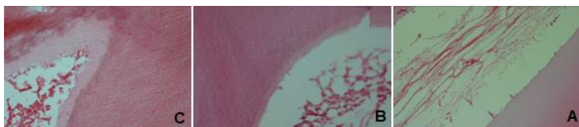
Figure 2. Absence of predentin (A) thin layer of predentin (B) thick layer of predentin (C) (H&E staining×40)