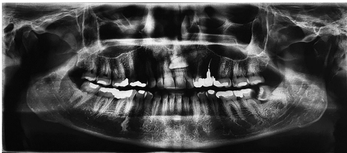
Figure 1. Panoramic image at the first visit

All procedures of this study followed were in accordance with the ethical standards of the responsible committee on human experimentation (institutional and national) and with the Helsinki Declaration of 1975, as revised in 2008. This research project was approved by Mashhad University of Medical Sciences and conducted in the Dental Radiology Center, Mashhad University of Medical Sciences, Mashhad, Iran. The authors would like to express their gratitude to all those who sincerely participated in the study. A 47-year-old male patient was referred to a private dental clinic due to pain and the need for extraction of a wisdom tooth on the left side of the mandible. Following the initial examination, a panoramic image was taken. The image revealed that tooth #38 was in a mesioangular position with occlusal caries, leading to decay in the distal aspect of the second molar (Figure 1).