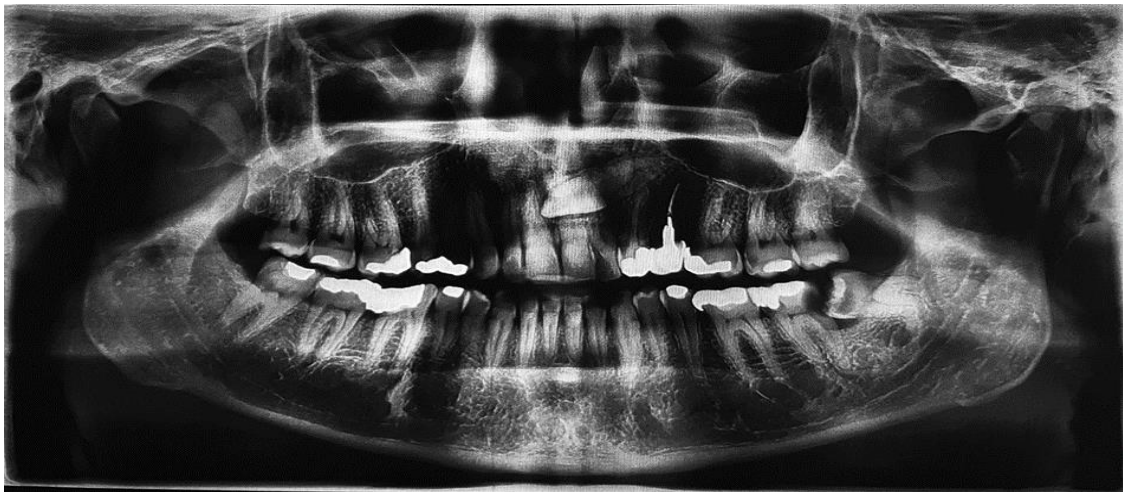
Figure 1. Panoramic image at the first visit

All procedures of this study followed were in accordance with the ethical standards of the responsible committee on human experimentation (institutional and national) and with the Helsinki Declaration of 1975, as revised in 2008. This research project was approved by Mashhad University of Medical Sciences and conducted in the Dental Radiology Center, Mashhad University of Medical Sciences, Mashhad, Iran. The authors would like to express their gratitude to all those who sincerely participated in the study. A 47-year-old male patient was referred to a private dental clinic due to pain and the need for extraction of a wisdom tooth on the left side of the mandible. Following the initial examination, a panoramic image was taken. The image revealed that tooth #38 was in a mesioangular position with occlusal caries, leading to decay in the distal aspect of the second molar (Figure 1).