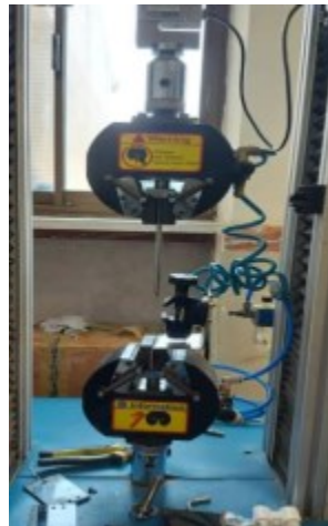
Figure1. Sample mounted on the device

Finally, the data were analyzed SPSS 20 using T-test at significant level of P < 0.05 .