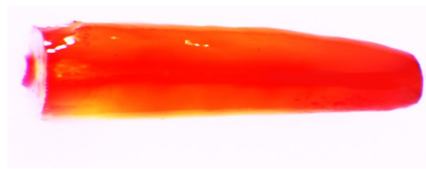
Fig3. A specimen of negative control without microleakage