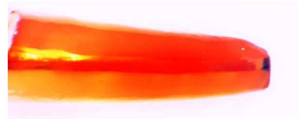
Fig 2. A specimen of a biodentine microleakage