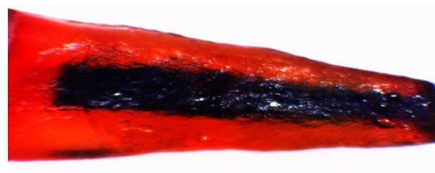
Fig4. A specimen of a positive control with maximum microleakage

To measure the dye penetration, a stereomicroscope (Dewinter, Italy) with a magnification of 20 was used. The highest amount of dye penetration along the gutta percha was recorded by Dewinter Capture Pro 4.6 software for each sample (Fig5).