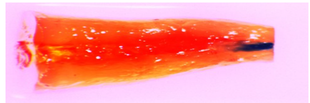
Fig 1. A specimen of a MTA microleakage

Finally, dehydration was performed by ethylic alcohol (Merck, Frankfurt, Germany) with different percentages. The samples were kept in 75% alcohol for 24 hours, 85% alcohol for 1 hour and 3 one-hour sessions in 96% alcohol. Then, the teeth were placed in methyl salicylate liquid (Merck, Germany). After 3-4 hours, as shown in figures, the samples become completely clear and their internal contents become visualized