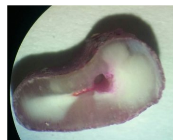
Figure1. 3-mm-cross-sectional slice without dentinal crack (right) and with dentinal complete crack (left)