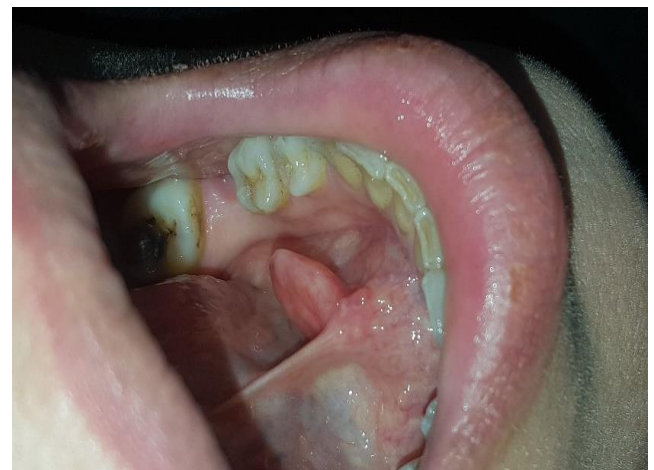
Figure 1. Clinical feature

A 34-year-old female patient with swelling in the floor of the mouth referred to the Oral Medicine Department of Babol University of Medical Sciences. This lesion has been appeared in the floor of the mouth four years ago and its size has gradually increased. In intraoral examination, there was an exophytic mass which was sessile and covered with intact mucosa with the same color. It was 1/5×1×0/5 cm 3 lesion in the floor of the mouth on the left side of the midline (figure1). The patient did not have any disorders in submandibular gland. The patient had no marked medical history, but a history of rheumatism.