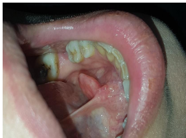
Figure 1. Clinical feature

A 34-year-old female patient with swelling in the floor of the mouth referred to the Oral Medicine Department of Babol University of Medical Sciences. This lesion has been appeared in the floor of the mouth four years ago and its size has gradually increased. In intraoral examination, there was an exophytic mass which was sessile and covered with intact mucosa with the same color. It was 1/5×1×0/5 cm 3 lesion in the floor of the mouth on the left side of the midline (figure1). The patient did not have any disorders in submandibular gland. The patient had no marked medical history, but a history of rheumatism.