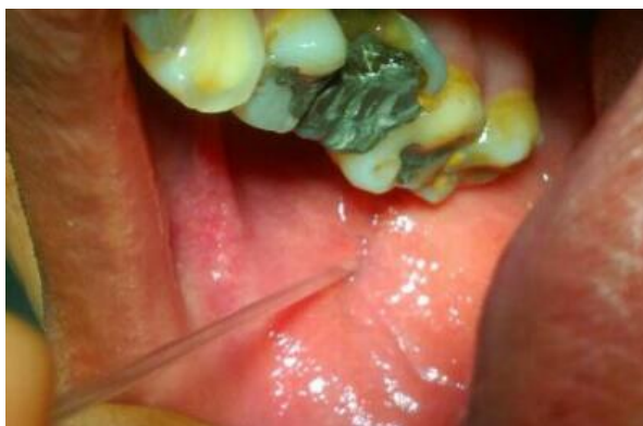
Figure1. Sampling saliva of parotid by laboratory micro hematocrit tube

special paste to prevent the outflow of saliva. This process is repeated for the gland of other side. Each person was assigned a number. The tube containing the saliva of each side was attached on the paper marked in terms of patient's number and their left and right side. The tubes containing saliva can be refrigerated until shipment to the laboratory. Age, sex, dominant side used during chewing and phone conversation, duration of daily calls and use of mobile phone were recorded. To increase the accuracy of recording the dominant side, a chewing gum was given to patient without informing them about the goal, they were asked to chew. All observations and oral examinations were recorded.