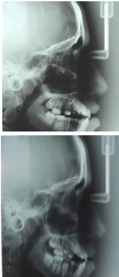
Figure 3. Upper: lateral cephalogram of pretreatment of 11 year old girl. Lower: posttreatment of the same patient and miniscrew placed in the palate. The upper molars were distalized

The figure 4 shows the superimposition of maxillary teeth before and after molar distalization. The amount of distalization in the first patient was 4 mm with 2 degrees of tipping, 4 mm with 5 degrees of tipping in the second patient, and 3.5 mm with 2 degrees of tipping in the third patient. The maxillary second molars were distalized 3 mm in the three patients. The long axis of this tooth exhibited distal tipping of 2 degrees in the first patient and 3 degrees in the second and third patients.