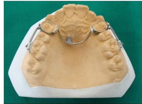
Figure1. Skeletal supported anchorage for molar distalization

The subjects were recalled at 4-week intervals and the coil springs were activated again and when the patient's occlusal relationship was converted to CI III up to 2 mm, distalization was terminated. Then the palatal arch was removed and replaced with Nance holding arch on molars to preserve the space. The mini-screw mobility was examined with zero (no movement) and one (presence of mobility) criteria after placement and at the end of distalization. Visual analogue scale was used to evaluate patient pain and discomfort one week after mini-screw placement and during its removal. Patients were asked to rate their expected pain experience on a 100-mm visual analog scale (VAS), where "0" represented no pain and "100" represented the worst pain imaginable. The following cut points on the pain VAS have been recommended: no pain (0–4 mm), mild pain (5–44 mm), moderate pain (45–74 mm), and severe pain (75–100 mm). [16] After the distalization period, a new cephalometric evaluation was carried out under the same conditions. The pre- and post-operative cephalograms were analyzed using the analysis techniques proposed by Nanda and Ghosh (Figure 2). [17] To determine the center of the tooth crown, the most prominent points in mesial and distal of the crown were connected by a line and the middle of this line was considered as the center of the crown (centroid). This line was used to evaluate linear-dental changes.