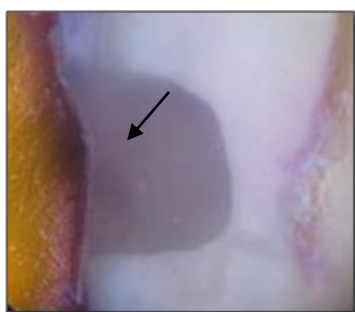
Figure1. Illustration of specimen with no leakage (Score0)

* The level of significance was considered at p < 0.05