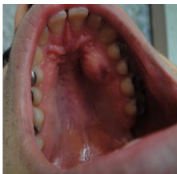
Figure 1. Clinical view of the patient's oral lesion