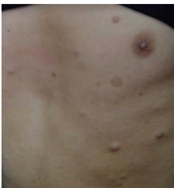
Figure 2. Clinical view of subcutaneous nodules and café au lait macules on the patient's trunk

The microscopic examination revealed a tumor that composed of spindle shaped cells with wavy nuclei scattered in a fibrous to myxoid stroma (figure 3 and 4). Neurofibroma, neurilemmoma and palisaded encapsulated neuroma can be considered as differential diagnoses. Considering the whole microscopic features, neurofibroma was rendered as the histopathologic diagnosis and also, neurofibromatosis was described as the final diagnosis based on combining clinical and microscopic findings.