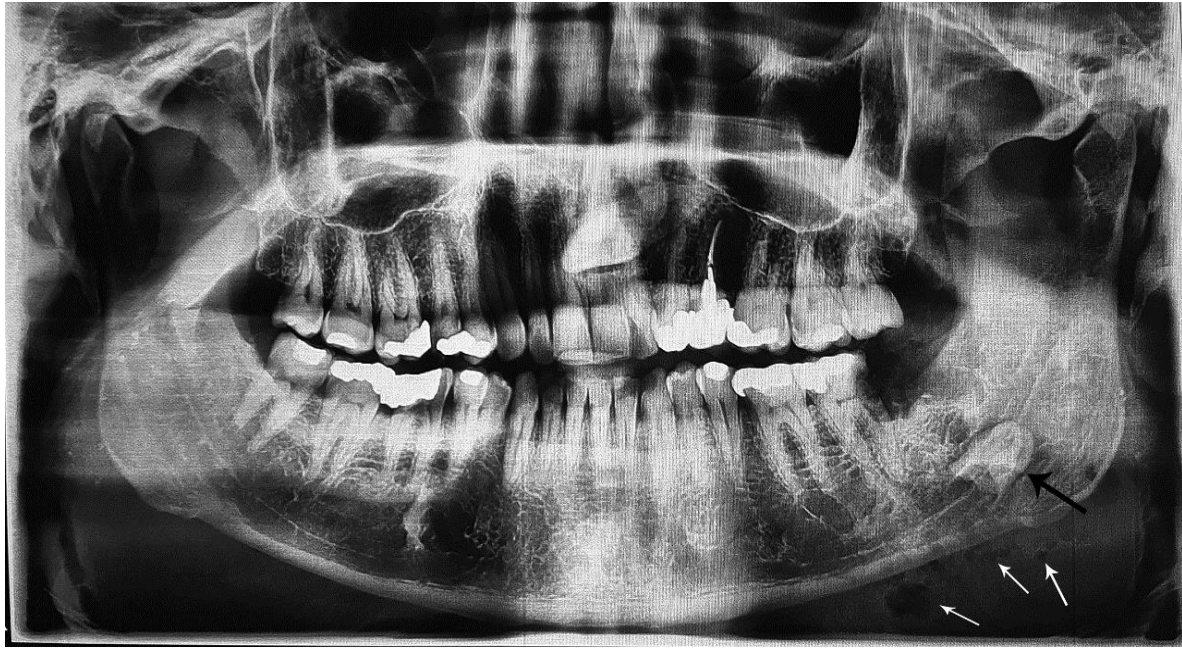
Figure 2. Panoramic image was conducted after the first surgical intervention. Displaced left mandibular third molar root (black arrow), and emphysema were seen (white arrows).