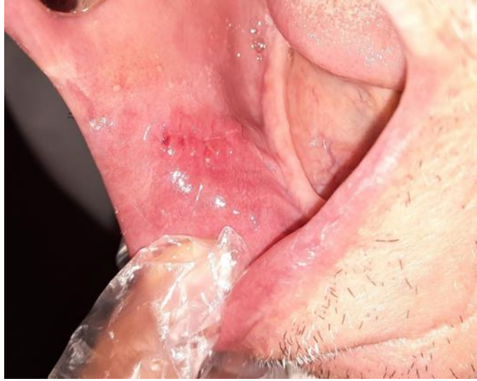
Figure 3. After 10 days of follow-up