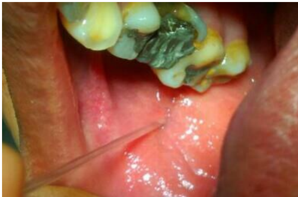
Figure1. Sampling saliva of parotid by laboratory micro hematocrit tube

special paste to prevent the outflow of saliva. This process is repeated for the gland of other side. Each person was assigned a number. The tube containing the saliva of each side was attached on the paper marked in terms of patient's number and their left and right side. The tubes containing saliva can be refrigerated until shipment to the laboratory. Age, sex, dominant side used during chewing and phone conversation, duration of daily calls and use of mobile phone were recorded. To increase the accuracy of recording the dominant side, a chewing gum was given to patient without informing them about the goal, they were asked to chew. All observations and oral examinations were recorded.