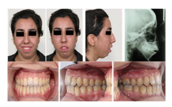
Figure 4. Posttreatment records