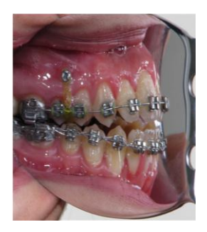
Figure 3. Presurgical records

Then orthognathic surgery was done according to determined treatment plan. After surgery, finishing phase of orthodontic treatment was done and for retention phase a lingual bonded retainer in mandible and Hawley retainer in maxilla were prescribed. Furthermore, the training of tongue posture was given