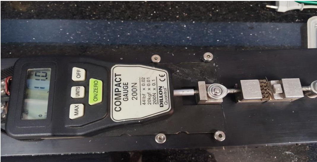
Figure 1. Micro-tensile tester

* 4-MET (4-methacryloxyethyl trimellitic acid), MDP (methacryloyloxydecyl dihydrogenphosphate), MDTP (methacryloyloxydecyl dihydrogen triphosphate), BisGMA (Bisphenol glycidyl methacrylate), HEMA (hydroxyethyl methacrylate), VBATDT (6- (4-vinylbenzylpropyl) amino-1,3,5-triazine-2,4-ditione), TEGDMA (triethylene glycol dimethacrylate and BIS-EMA (ethoxylated bisphenol-A dimethacrylate)