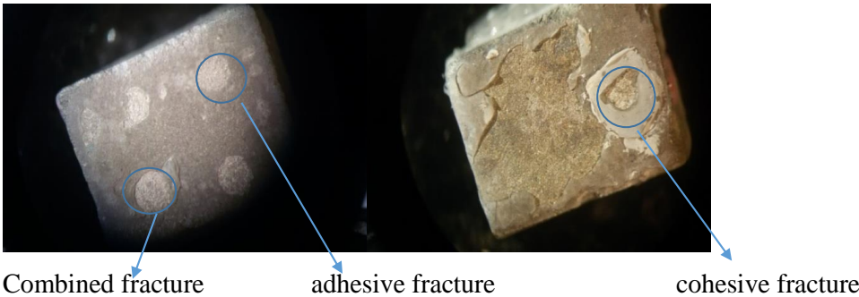
Figure 2. Different fracture patterns under a stereomicroscope

Statistical analysis was performed using SPSS Inc. (SPSS Inc., Chicago, IL, USA) 24SPSS. The Kolmogorov-Smirnov one-sample test showed that the data distribution was not normally distributed. Therefore, the Kruskal-Wallis test was applied to compare the bond strength, and the Mann-Whitney test was used for pairwise comparison. The chi-square test was utilized to evaluate the fracture types in the groups.