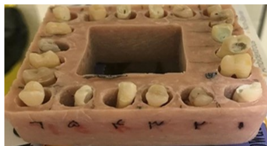
Figure1. The Preparation of the Block for Teeth Maintenance

group). The teeth from CEJ zone were kept within a block made of an equal mixture of Cold-Cure Acrylic powder (Acropars, Marlic Co, Iran), and bone powder of sheep skull to simulate hard tissue trabecular (Figure 1). The roots of the teeth were inserted into the molten red wax (Cavex, Netherlands) to create a resemblance through the PDL space and were then embedded in the mixture of the acrylic and bone powder.