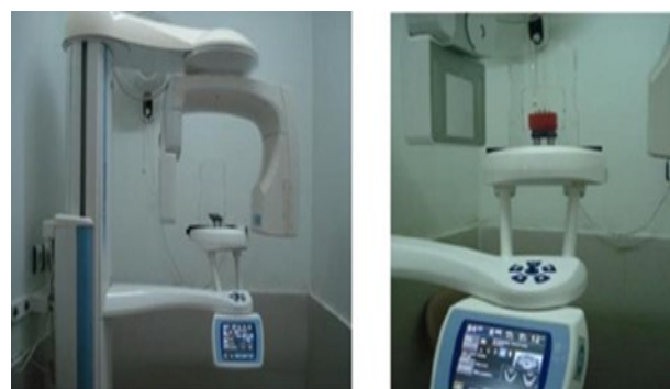
Figure2. The Samples placed on NewTom CBCT

CBCT Scans: The CBCT images of each block were made by a CBCT device (NewTom VGi, Verona, Italy) with the exposure parameters of mAS60 / 63, KV84 S4 / 5 and field-of-view (FOV) = 8 × 8, while protection protocol against X-rays was implemented (Figure 2). All images were imported to a desktop computer with a Samsung SyncMaster 2220WM 22-inch LCD monitor (Samsung, Seoul, South Korea). The CBCT images were evaluated using NNT Viewer version 3.00 [QR Srl]. The axial and cross-sectional image slices (1 mm thickness at 0.5 mm intervals) were examined by the assistance of a qualified oral and maxillofacial radiologist with the guidance of an eligible endodontist. None of the observers had prior knowledge of CBCT scans (Figure 3). Each examiner was permitted to use the Viewer software to regulate contrast, brightness and angulations in line with individual inclination.