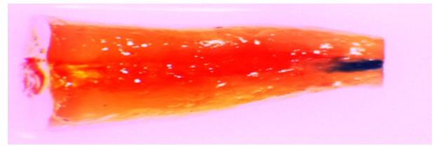
Fig 1. A specimen of a MTA microleakage

Finally, dehydration was performed by ethylic alcohol (Merck, Frankfurt, Germany) with different percentages. The samples were kept in 75% alcohol for 24 hours, 85% alcohol for 1 hour and 3 one-hour sessions in 96% alcohol. Then, the teeth were placed in methyl salicylate liquid (Merck, Germany). After 3-4 hours, as shown in figures, the samples become completely clear and their internal contents become visualized