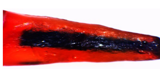
Fig4. A specimen of a positive control with maximum microleakage

To measure the dye penetration, a stereomicroscope (Dewinter, Italy) with a magnification of 20 was used. The highest amount of dye penetration along the gutta percha was recorded by Dewinter Capture Pro 4.6 software for each sample (Fig5).