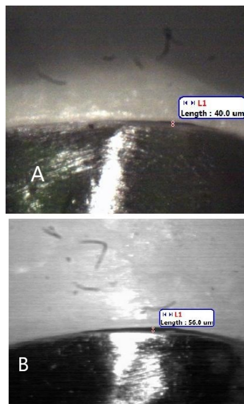
Figure 1. Measuring marginal fitness of crowns on metallic dies under a stereomicroscope (40X). A: before applying the veneering layer, B: after applying the veneering layer

Altstätten, Switzerland ) was used for uniform porcelain placement. From an impression of an enlarged wax-up (DandIran, Tehran, Iran), the index was made to compensate for the sintering shrinkage of the porcelain (20%). The total thickness of the porcelain veneer was 1.25 mm before firing. Three firings were needed for each sample. The porcelain was glazed (Vita Akzent; Vita Zahnfabrik, Germany) with the final firing.