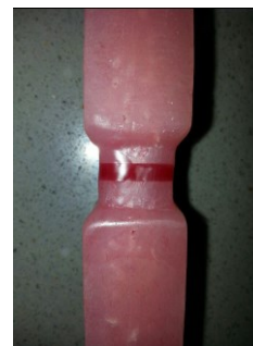
Figure 1. Acrylic specimens with 3mm wax in its narrowest part

Using soft liners: Each group were divided into two subgroups of 9 specimens for better investigation of each subgroup with one type of soft liner. To put and process the liners, a wax (Betadent-Macu-Iran) thickness equal to the thickness of the liner was placed in a 3-mm space (Figure1). Then, to prevent any disturbance in the flasking process, the excess wax was removed using scaple and no 15 blade.