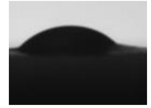
Fig. 1-Sessile drop of bonding agent on the dentin surface

The profile of the droplets was recorded with a video-based optical contact angle measuring system (OCA 15EC, Data physics Instruments, GmbH, Germany) immediately after drop application and analyzed using drop angle analysis software (SCA20, Data physics Instruments, GmbH, Germany) for sessile drop static contact angle measurements (fig.1). The statistical analysis was performed by IBM SPSS statistics 22.0 using One-way ANOVA and Dunnett t tests with the significant level at the p=0.05.