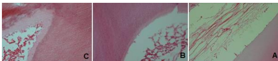
Figure 2. Absence of pre dentin (A) thin layer of pre dentin (B) thick layer of pre dentin (C) (H&E staining×40)