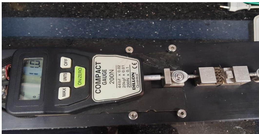
Figure 1. Micro-tensile tester

* 4-MET (4-methacryloxyethyl trimellitic acid), MDP (methacryloyloxydecyl dihydrogenphosphate), MDTP (methacryloyloxydecyl dihydrogen triphosphate), BisGMA (Bisphenol glycidyl methacrylate), HEMA (hydroxyethyl methacrylate), VBATDT (6-(4-vinylbenzylpropyl) amino-1,3,5-triazine-2,4-dithione), TEGDMA (triethylene glycol dimethacrylate and BIS-EMA (ethoxylated bisphenol-A dimethacrylate)