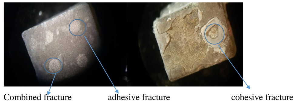
Figure 2. Different fracture patterns under a stereomicroscope

Statistical analysis was performed using SPSS Inc. (SPSS Inc., Chicago, IL, USA) 24SPSS. The Kolmogorov-Smirnov one-sample test showed that the data distribution was not normally distributed. Therefore, the Kruskal-Wallis test was applied to compare the bond strength, and the Mann-Whitney test was used for pairwise comparison. The chi-square test was utilized to evaluate the fracture types in the groups.