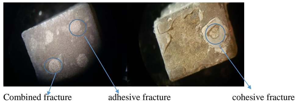
Figure 2. Different fracture patterns under a stereomicroscope

Statistical analysis was performed using SPSS Inc. (SPSS Inc., Chicago, IL, USA) 24SPSS. The Kolmogorov-Smirnov one-sample test showed that the data distribution was not normally distributed. Therefore, the Kruskal-Wallis test was applied to compare the bond strength, and the Mann-Whitney test was used for pairwise comparison. The chi-square test was utilized to evaluate the fracture types in the groups.