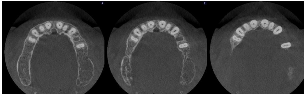
Figure 2. The axial plane to check the number and shape of the canals

To study the morphology of the roots, after obtaining the MPR images (sagittal and coronal axes were set along the longitudinal axis of the root to allow for the tooth apex to be well visible), the assessment was carried out based on Vertucci classification. [41] The information in the checklist was entered into SPSS-21 software one by one. The quantitative data were reported as “Mean \pm SD” and qualitative data as “number (percent)”. The non-parametric Kolmogorov-Smirnov test was used to assess the normality of the frequency distribution of the quantitative variables. The independent two-sample t-test and Chi-square test or Fisher’s exact test were used to evaluate the canal anatomy of permanent maxillary first premolars by gender, number of roots, and number and type of canals. The significance level was P < 0.05 for all the tests.