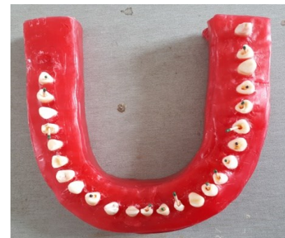
Fig.2 mounting teeth in the U-shaped wax rim.

Radiographic examination: The CBCT scans were obtained using denture scan mode of Newtom 5G System (QR srl, Verona, Italy) set at 110kv and a tube current of 3.46 mA and a mean time of 4.8 seconds with an FOV of 18x16 cm and a voxel size of 0.3 mm. The scans were examined in three planes of axial, coronal and sagittal in multi-planar reformation (MPR) by using NNT viewer software version 3.0 (QR srl, Verona, Italy). The slice thickness was 0.5 mm in this study. Scans were examined by two trained endodontists twice with two-week interval for the presence or absence of a horizontal root fracture (figure 3). The observation was done in a low-light room with the LG Flatron 18.5 inch monitor (LG, Seoul, Korea) and observers were free to choose magnification. In addition, the observers were unaware of how many samples had fracture.