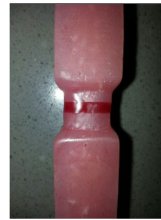
Figure 1. Acrylic specimens with 3mm wax in its narrowest part

Using soft liners: Each group were divided into two subgroups of 9 specimens for better investigation of each subgroup with one type of soft liner. To put and process the liners, a wax (Betadent-Macu-Iran) thickness equal to the thickness of the liner was placed in a 3-mm space (Figure1). Then, to prevent any disturbance in the flasking process, the excess wax was removed using scaple and no 15 blade.