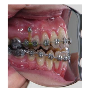
Figure3. Presurgical records

Then orthognathic surgery was done according to determined treatment plan. After surgery, finishing phase of orthodontic treatment was done and for retention phase a lingual bonded retainer in mandible and Hawley retainer in maxilla were prescribed. Furthermore, the training of tongue posture was given