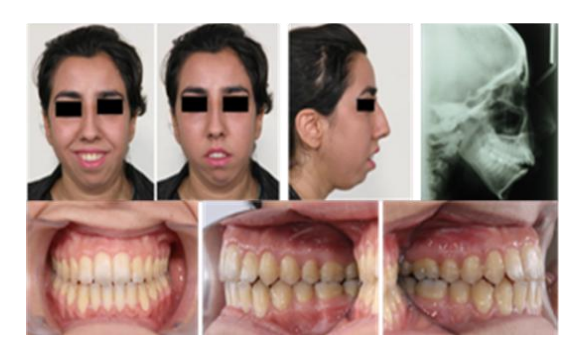
Figure 4. Posttreatment records